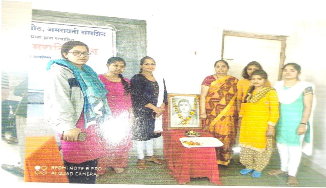
सावित्रीबाई फुले जयंती